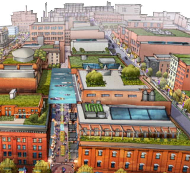
Living City Block is a not for profit 501 (c)(3) Colorado Corporation.

Living City Block will create a replicable, exportable, scalable and economically viable framework for the resource efficient regeneration of existing urban communities