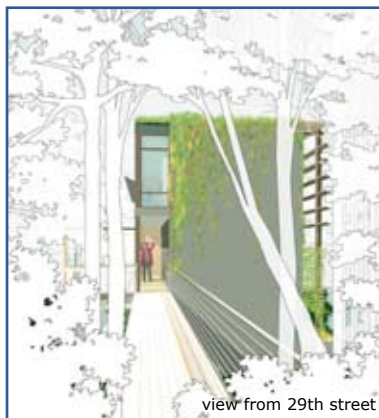
view from 29th street

Currently nearing completion, the project comprises OVE framing techniques throughout, earth-coupled heating & cooling, ERV, bamboo floors, regionally sourced stone countertops, and zero-VOC interior finishes.