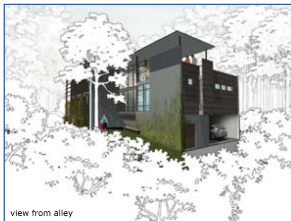
view from alley